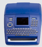
BMP®71 Label Printer