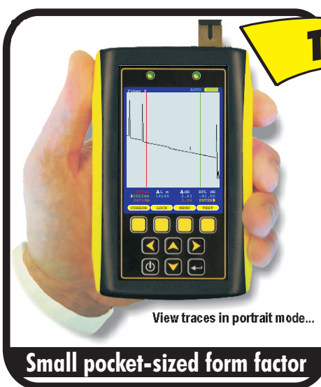
View traces in portrait mode...