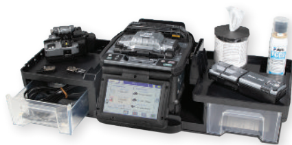
In Work Tray