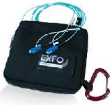
EF launch fiber (SPSB-EF-C30)

Whether for expanding enterprise-class businesses or large-volume data centers, new high-speed data networks built with multimode fibers are running under tighter tolerances than ever before. In the event of failure, intelligent and accurate test tools are needed to quickly find and fix the fault.