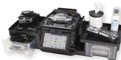
In Work Tray

The Fujikura 90R is the mass fusion splicer workhorse of the splicing world. As data demand continues to rise, the solution to handle the increased traffic is to increase fiber counts. As a result, fiber counts being utilized in enterprise data centers, campus, and metro networks have grown enough to make single fiber splicing too costly and timely. High density cabling made possible by SpiderWeb Ribbon® (SWR®) and others like it are spurring ribbon splicing activity in places that have traditionally used loose fiber. The 90R is the answer to these changes in splicing demand. With automated splice start, tube heater, wind protector, cleave tracking, and blade rotations for up to 2 cleavers at a time, this splicer frees up operator time for other fiber preparation steps. New to the 90R, you can keep your splicer in the field longer with field replaceable V-grooves. When V-grooves can no longer be cleaned after extended use, or are accidentally damaged, you can resume splicing in minutes by installing the spare set included with your 90R kit.