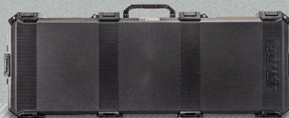
V800 LONG CASE

EXTERIOR DIMENSIONS 56.11" L 19.15" W 6.65" H