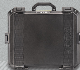
V550 LARGE CASE

EXTERIOR DIMENSIONS 22.42" L 17.46" W 9.16" H