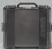
V600 LARGE CASE

EXTERIOR DIMENSIONS 24.55" L 20.59" W 10.16" H