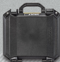
V200 MEDIUM CASE

EXTERIOR DIMENSIONS 15.41" L 13.08" W 6.16" H