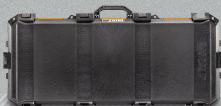
V700 LONG CASE

EXTERIOR DIMENSIONS 39.61" L 17.65" W 6.65" H