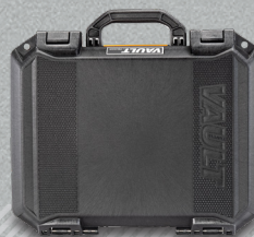
V300 LARGE CASE

EXTERIOR DIMENSIONS 17.54" L 14.21" W 7.16" H