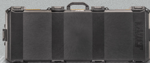
V730 LONG CASE

EXTERIOR DIMENSIONS 47.12" L 19.18" W 6.90" H