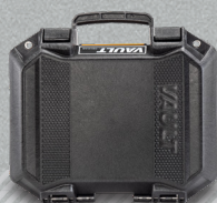
V100 SMALL CASE

Your favorite gear deserves a Vault by Pelican™ case. Our all-new line of hard cases gets you more protection for your money. In toughness and weather resistance, we've given the "off brands" a new challenge. Engineered with an optimized blend of materials and production methods that all add up to unmatched confidence – and value.