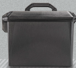
V250 LARGE CASE

EXTERIOR DIMENSIONS 16.27" L 7.90" W 11.93" H