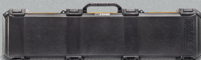
V770 LONG CASE

EXTERIOR DIMENSIONS 51.47" L 13.15" W 6.65" H