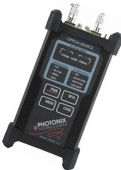
Note: Photos may vary from actual product