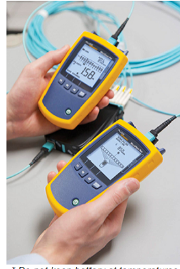
* Do not keep battery at temperatures below -20°C (-4°F) or above 50°C (122°F) for periods longer than one week to maintain battery capacity.