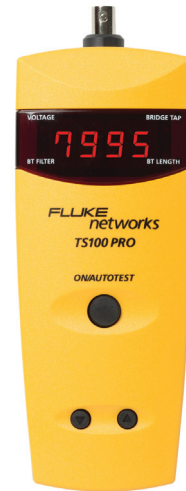
Open/short circuit detection – up to 8,000 feet (2,400 metres)

To learn more visit, www.flukenetworks.com/ts100pro