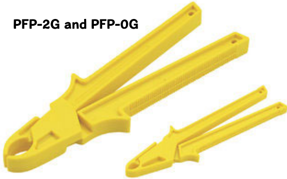
PFP-2G and PFP-0G