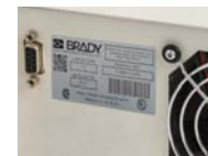
Rating plate labels