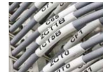
PermaSleeve® wire markers