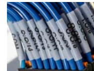
Wire ID labels