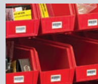
General ID and much more