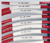
PermaSleeve® wire markers