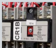
Panel component identification