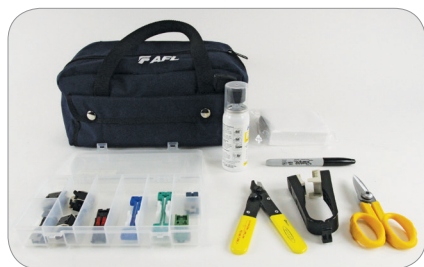
FUSEConnect Tool Kit Contents