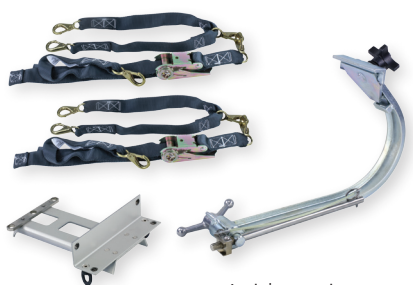
Aerial mounting system