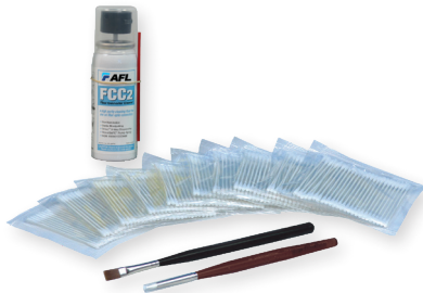
Splicer V-groove Cleaning Refill Kit