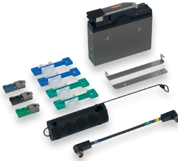
FuseConnect Installation Kit