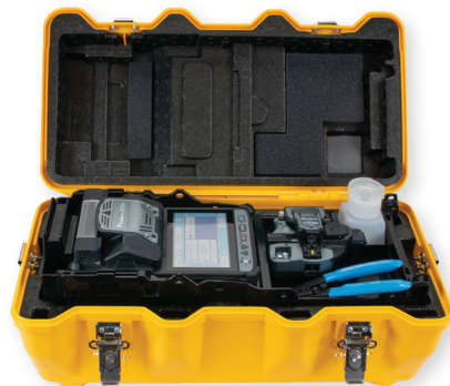
Workstation in Transit Case