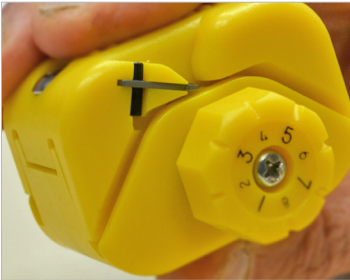
Spring-loaded design eliminates need to lock or clamp tool while in use.