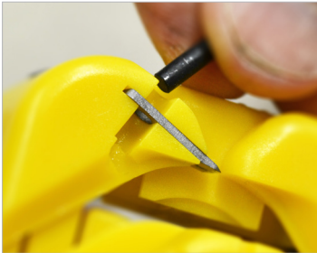
Fixed stainless steel blades require no adjustments and replace easily.