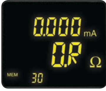
Indicates that the impedance is greater than 1500\Omega