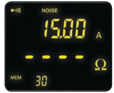
Indicates that the current is greater than 10A