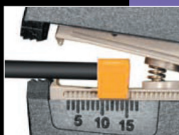
Adjustable Wire Stop