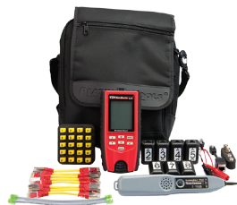
T130K3 Pro Kit

(8 Test-and-ID Smart remotes, adapters, cables and hanging pouch)