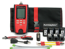
T130K2 Pro Kit

(20 Network ID-only remotes, adapters, cables and hanging pouch)