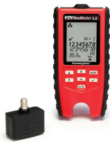
T130 Tester Only