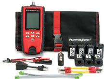
T130K2 Pro Kit

(20 Network ID-only remotes, adapters, cables and hanging pouch)