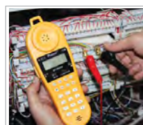
Telephone line testing