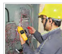
High impedance monitor