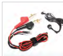
Accessories: Angled bed of nails & headset