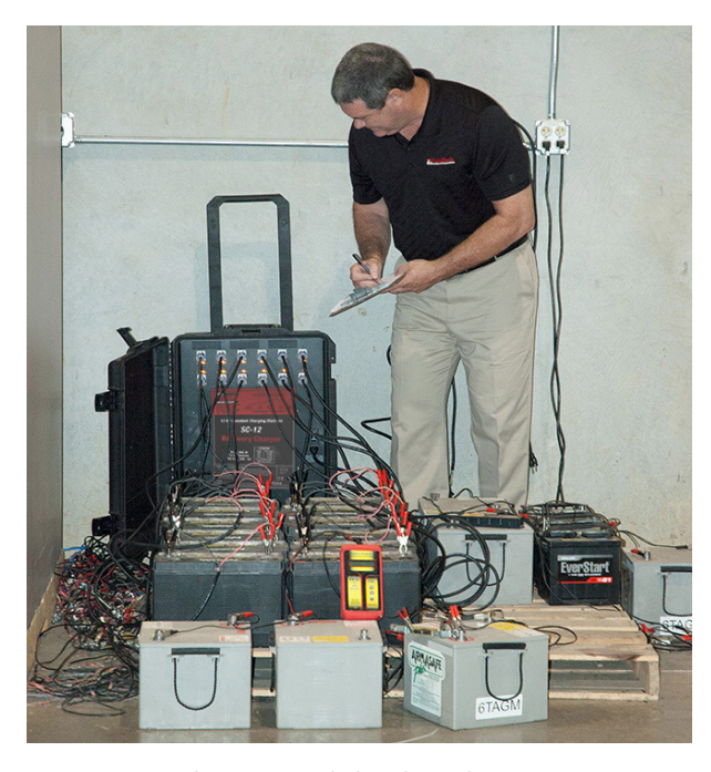
Which BMP Kit is Right for You?

The 390PT allows users to quickly, safely and accurately test 6-volt and 12-volt lead-acid batteries (VRLA, AGM, gel and flooded cell) in or out of the vehicle as well as 12-volt and 24-volt charging systems for proper operation. Combined single load, dynamic resistance technology and algorithms display battery voltage and cranking amp in easy to understand results in seconds. A handy "QUICK START" instruction guide is printed on the back of the tester. Use the 390PT to find battery and system issues before they become a problem. One-year limited warranty.