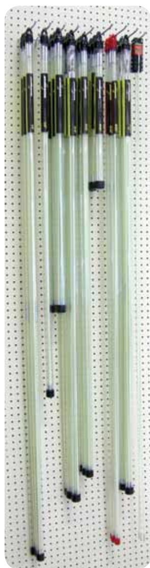
Point of Sale Packaging for Easy Display and Product Visibility

Permanently mounted bullet nose on each end.