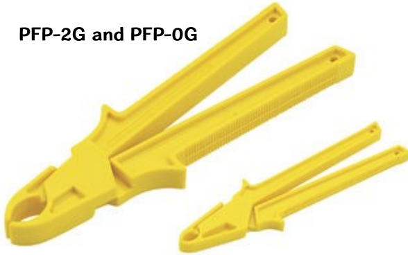
PFP-2G and PFP-0G