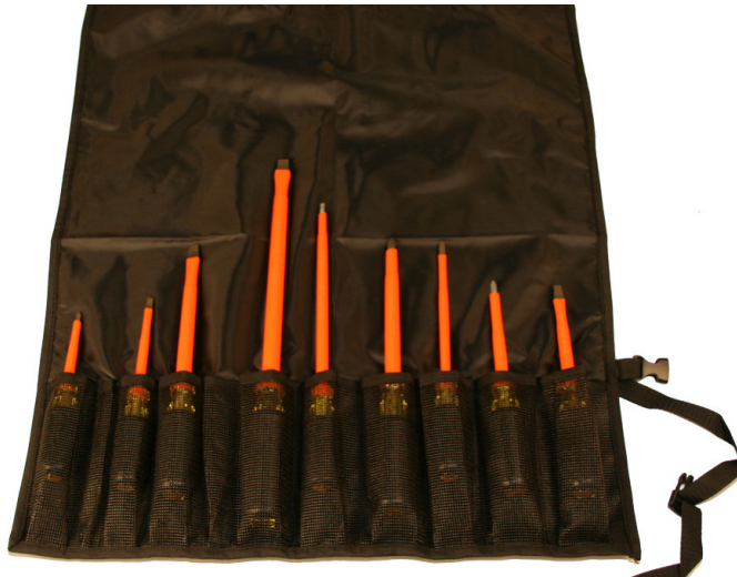
Image for illustrative purposes only— TR-9SD screwdriver roll pictured.