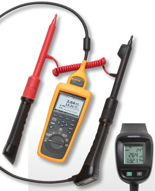
Intelligent test probe with integrated LCD display