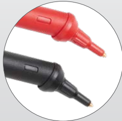
BTL20ANG Angled Measurement Probes