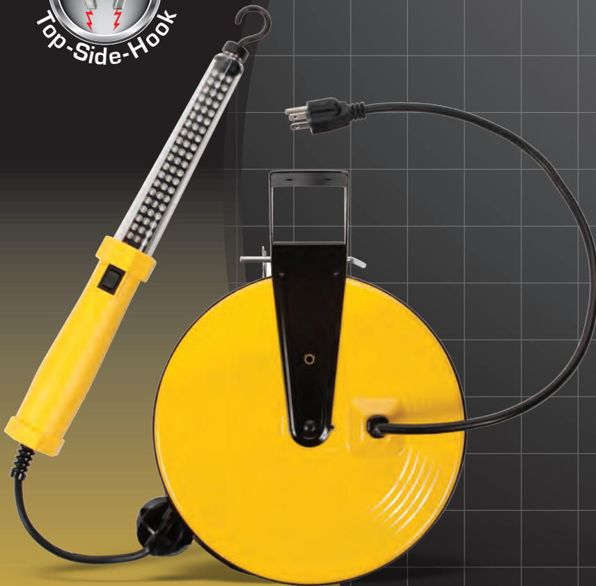
Model SL-864 50 ft. cord on retractable metal reel mounting kit included