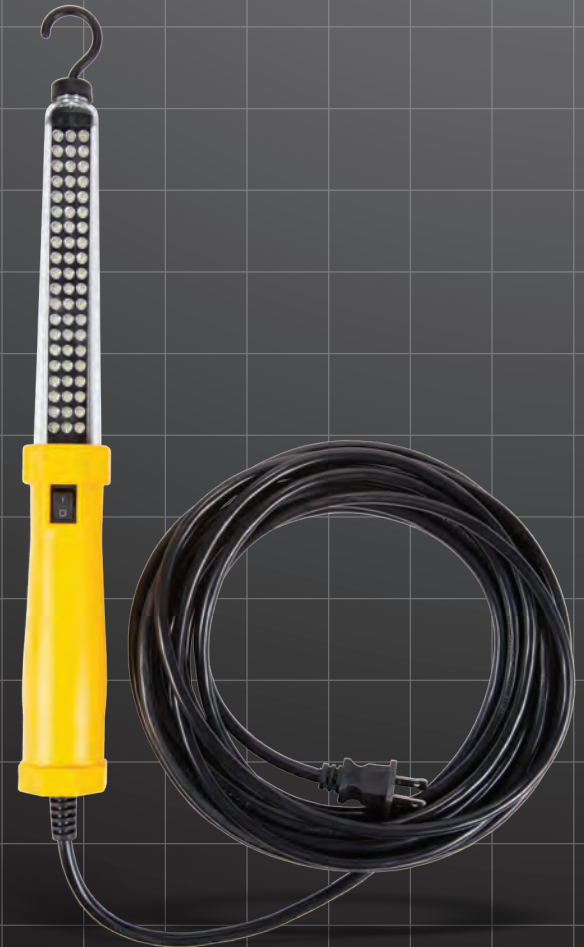
Model SL-2125 25 ft. cord