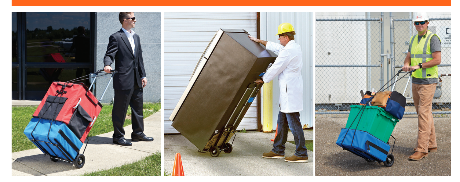
Whatever the need, the Super Cart can handle it.