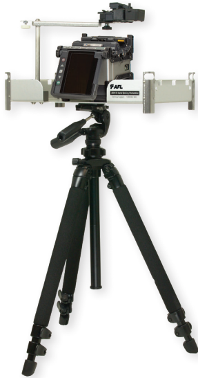
Portable Tripod Workstation Kit (splicer and cleaver not included)