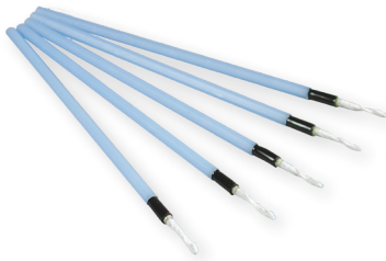
Type 1.25 mm