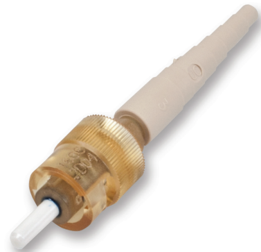
Part Number: 95-000-51