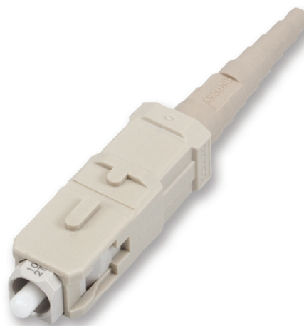
Part Number: 95-101-41-SP