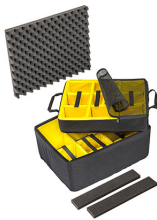
1607AirDS Padded Divider Set