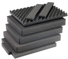
1607AirFS 3 pc. Replacement Foam Set