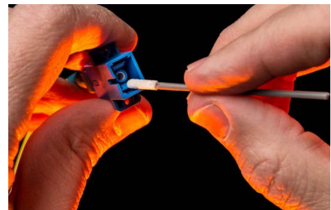
Step 4.2: Clean fiber optic connectors with 1.25 and 2.5mm swabs