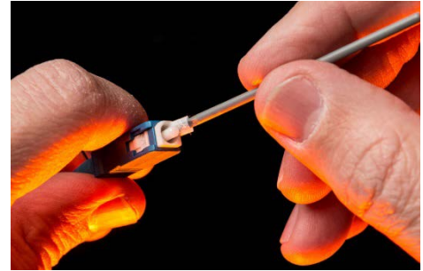
Step 5.3: Clean barrel of ceramic ferrule with swab