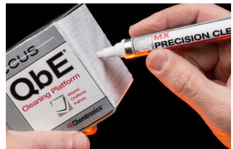
Step 5.1: Saturate wipe with Fiber-Wash MX Pen