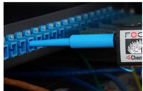
Step 4.1: Wet tip of CCT tool and clean fiber optic connectors