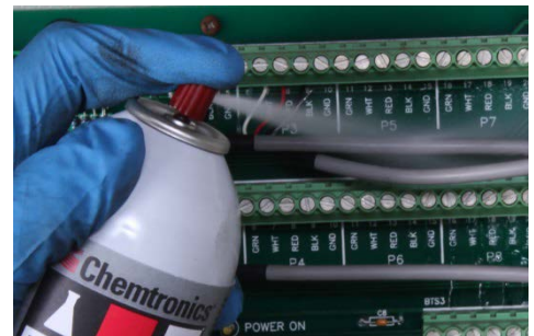
Step 2: Remove moisture with Flux-Off® Water Soluble cleaner and UltraJet® Duster