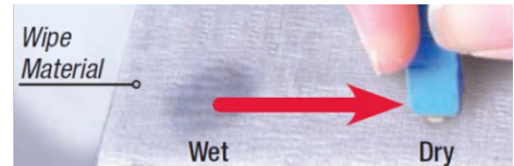
Step 5.2: Clean fiber optic end-face with Combination Cleaning™ process

Chemtronics® provides a technical hotline to answer your technical and application related questions. The toll free number is: 1-800-TECH-401.