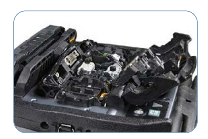
90S+ Wind Protector Open