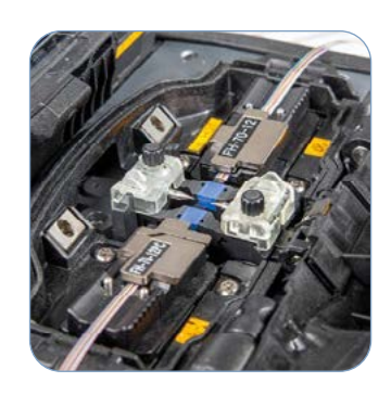
90R In Work Tray