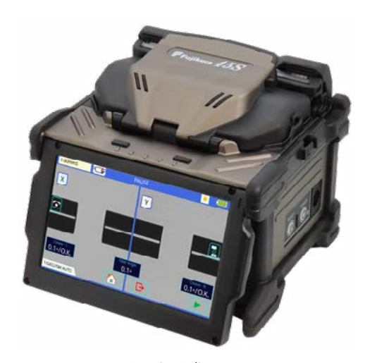
45S Fusion Splicer