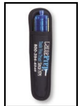
An optional belt holster keeps the tool handy.